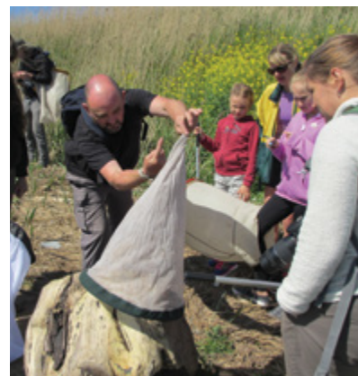
Bioblitz at the Speke and Garston Coastal Reserve

Many of the Peel Group's operating companies engage in community activity simply to involve and enthuse the local community. Peel Airport Group holds air shows at Durham Tees Valley and at Doncaster Sheffield Airport. City Airport and Heliport Manchester runs a programme of family activities every year, with one event alone attracting 8,000 people and raising £5,000 for charity.